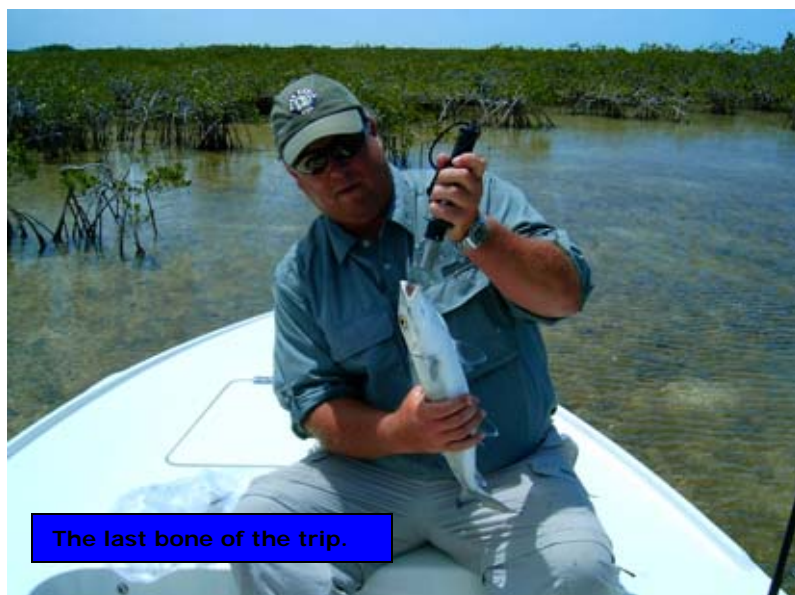
The last bone of the trip.

By now, it was close to noon and the tide was blowing out of this pocket. The bonefish were still milling around the mangroves, but the wind had also picked up to about twenty knots making an accurate cast almost impossible. So, being an adaptable sort of person, I picked up Donna's spinning rod to see if I could overcome the infernal winds. I made a quick shot at a single which took the jig and never slipped the light drag for more than about five feet of line. All it did was splash about on the surface showing off its silvery sides. After a couple of minutes, Pops exclaimed "Mon, there's something wrong with that fish." After the Boga, a quick snap shot, and a few high-fives, we cranked up the Merc, spun a few donuts to get up on a plane, and lit a shuck out of the back end of the Bird Pond leaving many nice bonefish behind on a rapidly falling tide.