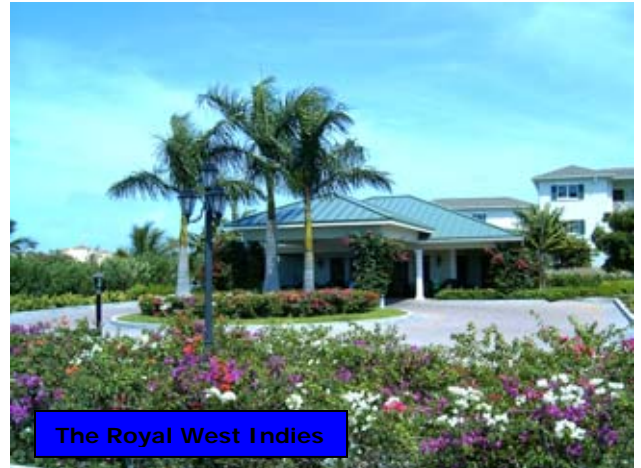
The Royal West Indies

I found a lot of useful information on the internet, most notably the cost of everything. Almost all goods in the Turks and Caicos have to be imported, including fuel. Gasoline was $4.17 a gallon, a case of beer will set you back $42 at the local IGA, and dinner for two, along with a couple of cocktails will take a C note plus. But, I guess that should be expected in a resort area. What I had a hard time dealing with was that a full day of bonefishing runs between $650 and $800, and offshore is in the $1,500 area. With my fishing budget set, my choices were 2 half days (at $450 each) or one full day. After having a several long e-conversations with my prospective guide, I decided one full day would be the best bet, with his main reasoning being the local population of bone fish get hit pretty hard and they run in the 1-2 pound range.