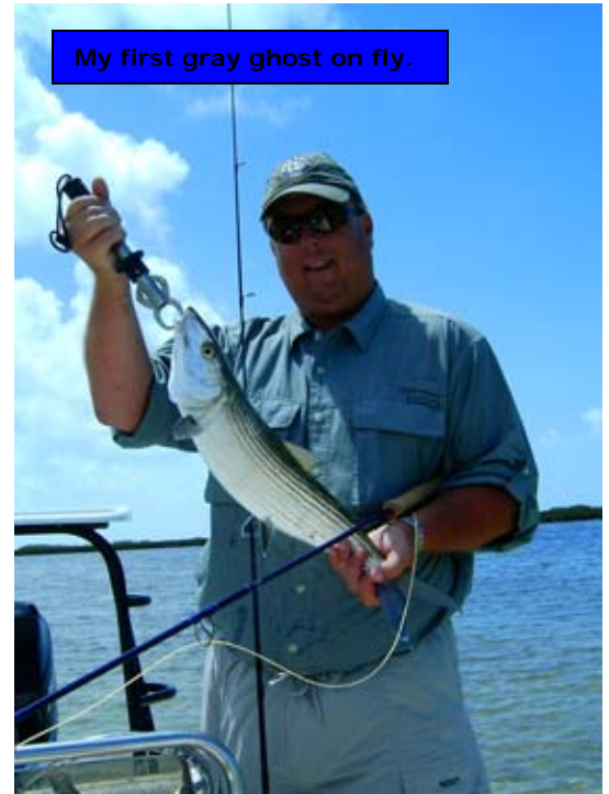
My first gray ghost on fly.

After a cold Bud Light and a brisk splash of ice cold water from the cooler, I was ready to go again. It took about two minutes for the next bonefish to show up. Unfortunately, his running buddy this time was a small barracuda that immediately scarfed up my Clouser, bit through the leader, and took off to points unknown. After a short break to re-tie, we were ready to go. So were the bonefish. For the next two hours, we watched some good sized schools of four to five pound bonefish mill around the edge of the open water keeping a line of mangroves between themselves and us. You would see singles and doubles break off and look like they were going to the open water only to turn at the last moment and blow your shot at a decent cast. I managed decent shots at four more bones, catching two in the five pound class on the fly. Neither fish was as physical as the first, but they did make it an interesting fight dodging in and out of the mangroves.