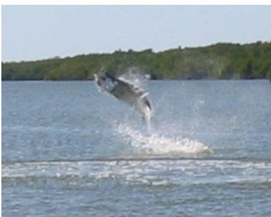
And the big one that (also) got away, estimated at 130 pounds